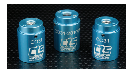
CTS C031 Connect

2. The operator inserts a custom CTS CO31 Connect with 316SS ID support/fill mandrel into each of the bag's open ports, allowing pressurization and/or sealing of the bag during test. The Connect is mated to one of the test ports on the instrument.